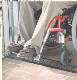
Low tapered threshold

(inset) For easy wheelchair access, door thresholds must be low and tapered. Sill weather stripping should not obstruct the wheelchair's small-diameter front wheels.